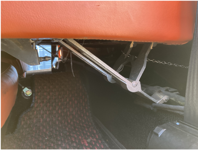
Hinges pictured in extended position.