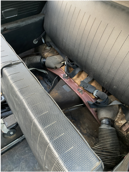
Fig. 1 Lift the rear seat bottom.