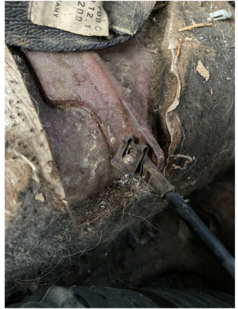
Fig. 2 Undo the cable clips.