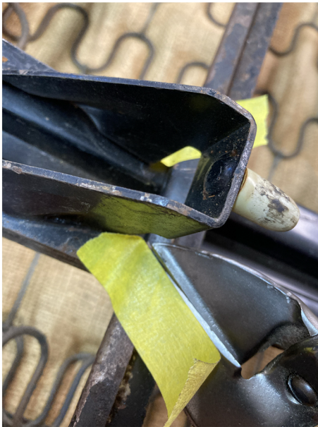
Fig. 7 Cut the U-Channel with tinsnips.