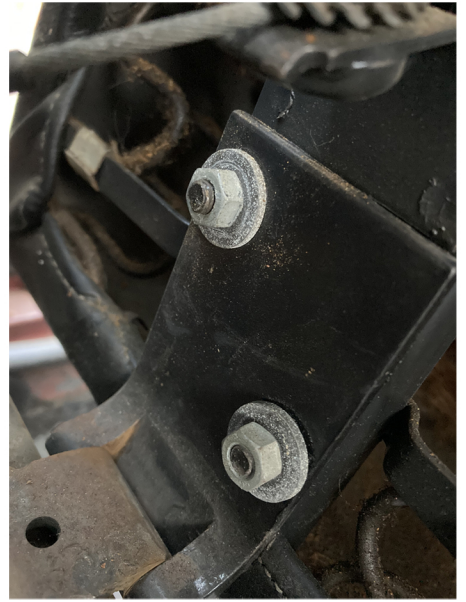
Fig. 3 Loosen the securing nuts and remove the seat from the vehicle.