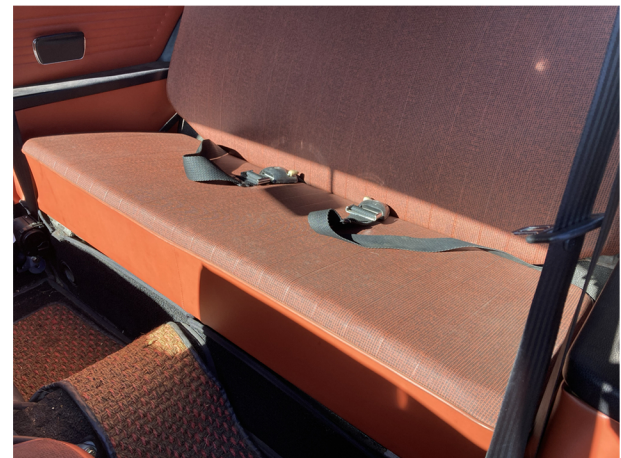
Rear seat in normal folded down position.