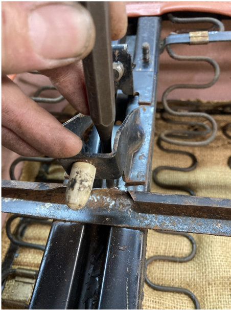
Fig. 9 Peen this flat with a punch or smooth with a file.