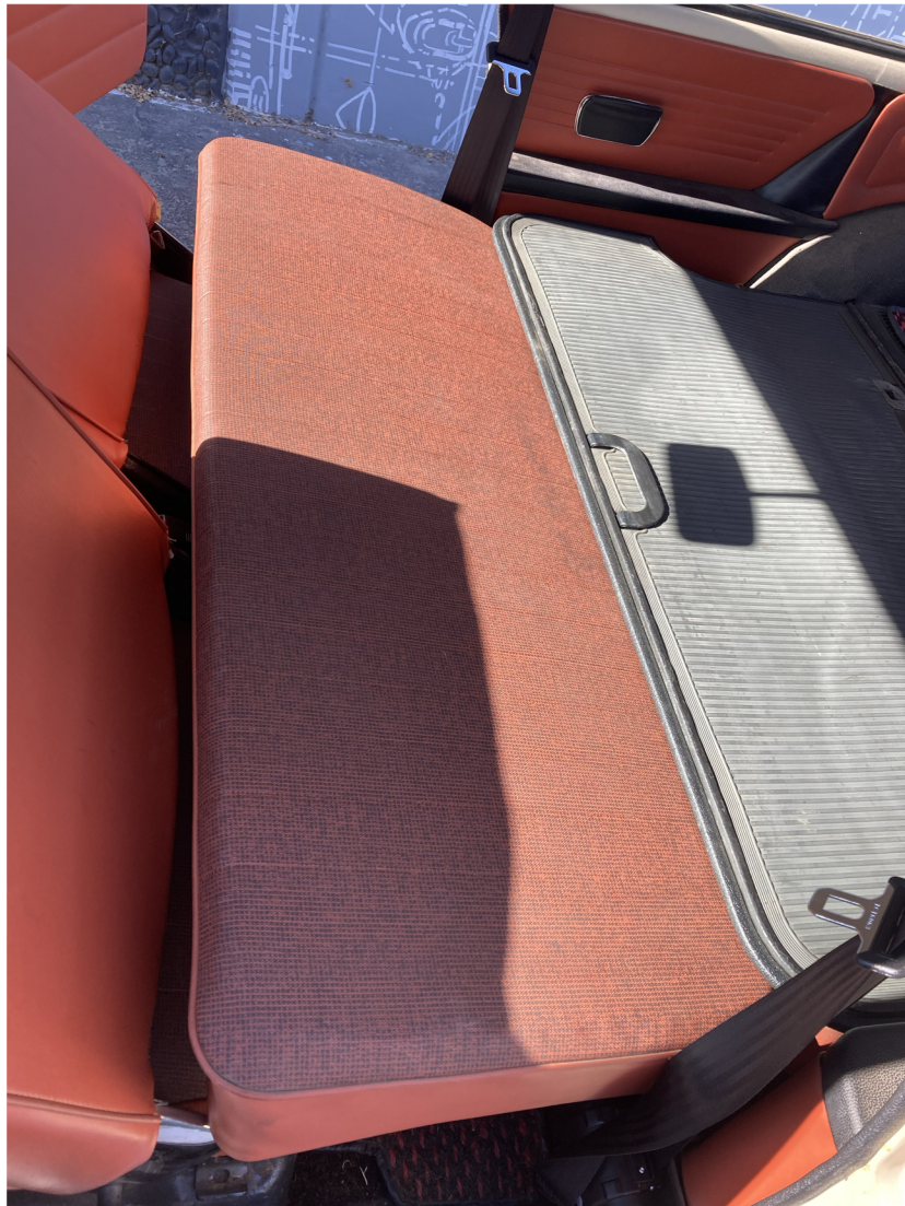
Enjoy your new ISP West accessory camping hinges!