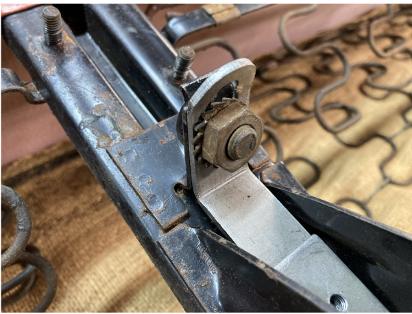
Fig. 5 Attach the hinge to the rear seat.