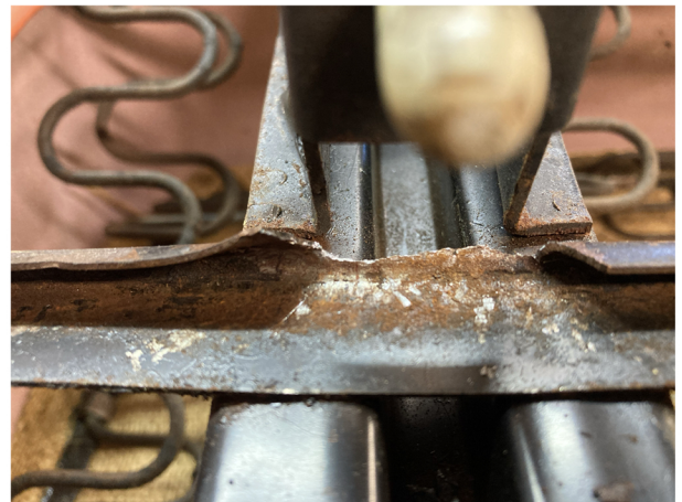
Fig. 8 Remove the center section between the cuts.