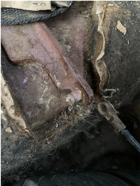
Fig. 2a Remove the cables.