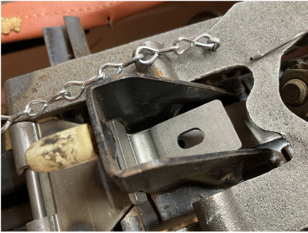
Fig. 12 Install the bracket.