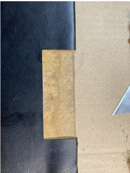
Fig. 11a Cut out this section from the panel completely.