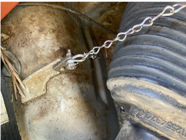
Fig. 15 Install the chain bracket onto the body. Secure with c-clip (not pictured).