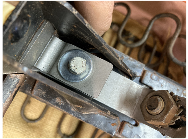
Fig. 13 Secure bracket to the hinge and install the 17mm nut & washer.