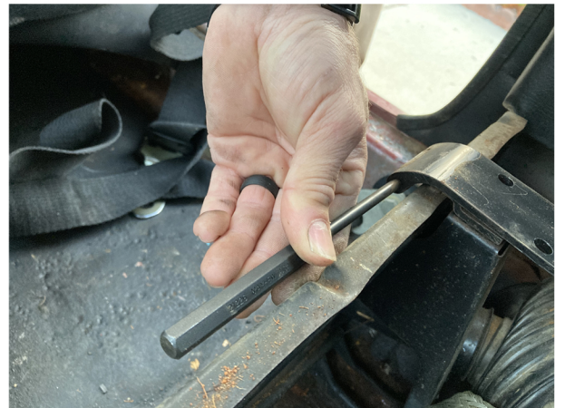
Fig. 4 Remove the pins from the seat bottom hinges.