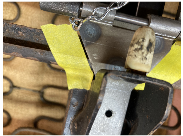
Fig. 6 Mark the U-channel with tape or a marker.