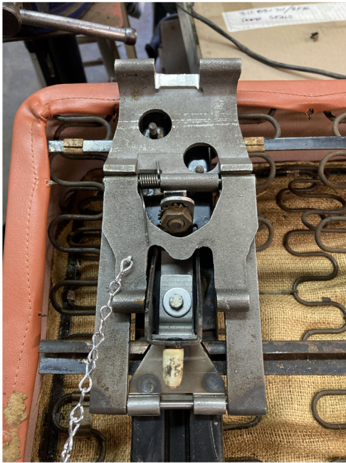
Installed bracket for reference.