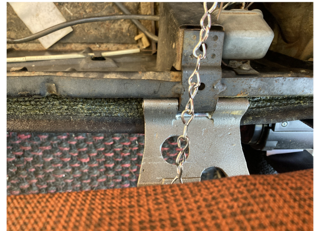
Fig. 14 Install the seat back into the vehicle. Install the hinge pins through the hinge and seat base.