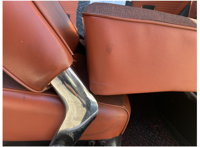
Rest rear seat front on front seat bottoms as pictured for support.